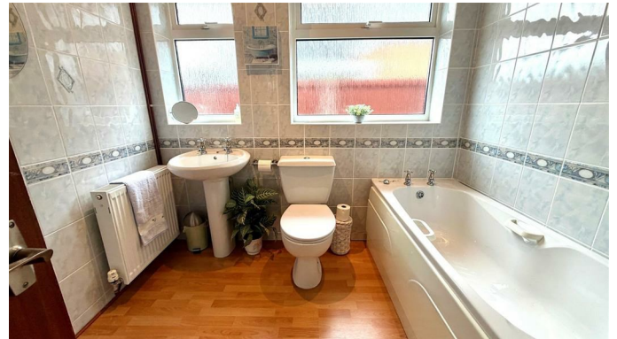
TILED 4-PIECE BATHROOM

In White, panel bath, separate shower stall with electric shower, pedestal wash hand basin and close coupled w.c, upvc double glazed window, radiator.