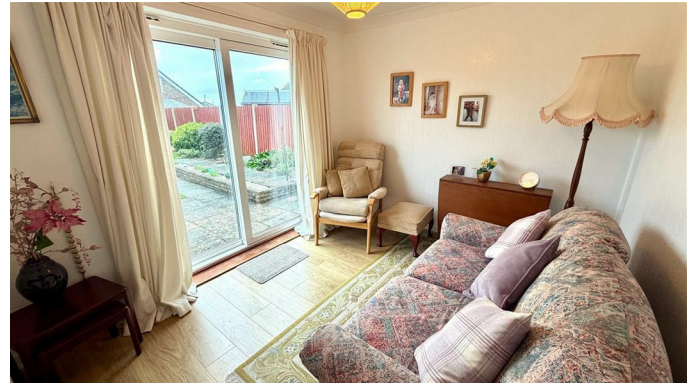
BEDROOM 3 10'9" x 9'0" (3.28m x 2.76m)

Upvc double glazed sliding patio door to the rear garden, radiator.