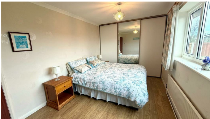
BEDROOM 2 12'7" x 8'10" (3.84m x 2.71m )

Plus built-in wardrobe with sliding mirror doors, upvc double glazed window, radiator.